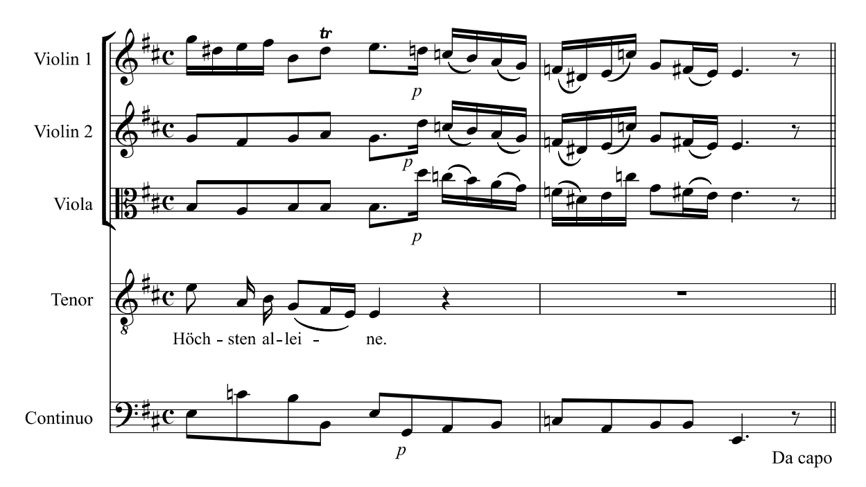
Example 5: 'Nur jedem das Seine', BWV 163/1, bb. 37-8 (end of B section)