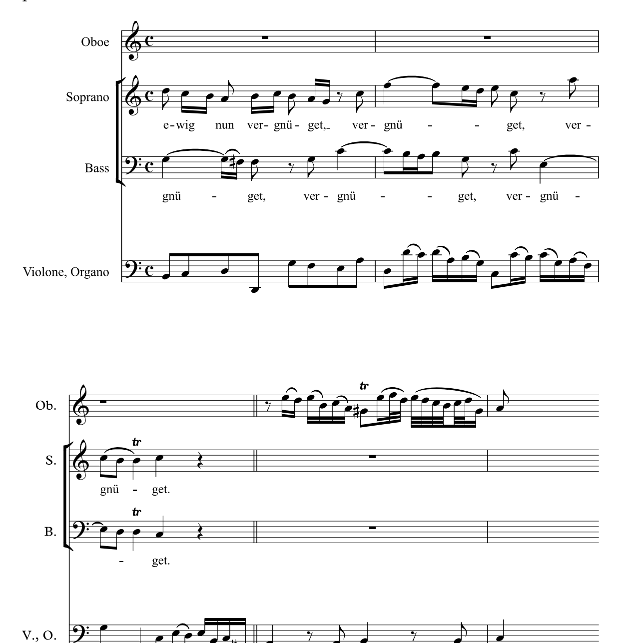
Example 3: 'Gott, du hast es wohl gefüget', BWV 63/3, bb. 40–2, 1 (end of B section and beginning of da capo)

as a hard ending (see Ex. 3). But instead Bach added a bit of connective tissue in the continuo: a brief semiquaver passage (b. 42, beats 3–4), which also happens to be the head-motive of the ritornello. Similarly, in 'Bäche von gesalznen Zähren', BWV 21/5, the cadence on the dominant C major (b. 38, beat 1) is followed immediately by a brief passage that links up directly with the first bar of the opening ritornello (see Ex. 4). As a result, the caesura that one expects at this point is smoothed over.