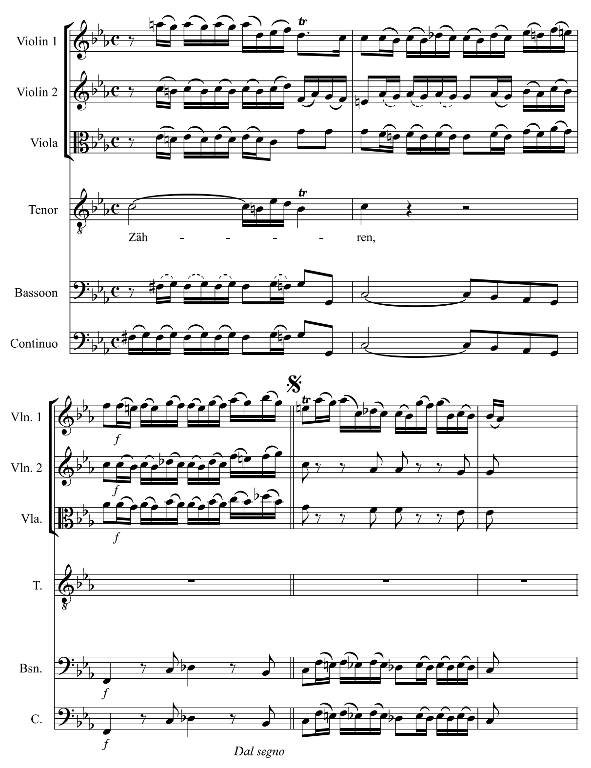
Example 4: 'Bäche von gesalznen Zähren', BWV 21/5, bb. 37–9, 2 (end of B section and beginning of da capo)

In addition to the hard and soft endings of B sections, Bach also devised some hybrid solutions we have already encountered, in a different context, at the beginning of this article. In 'Nur jedem das Seine', BWV 163/1, the B section ends with a cadence in the vocal line, followed by a brief instrumental epilogue with a hard ending – then the return to the beginning (see Ex. 5). Part of the novelty here