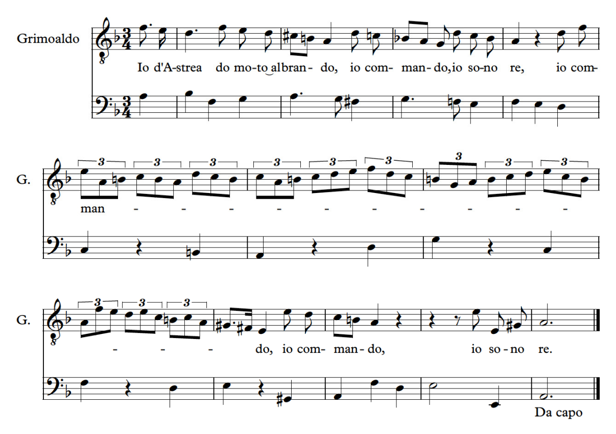
Example 1: Handel, 'Se per te giungo a godere' from Rodelinda, Act I, bb. 69b-81 (B section)